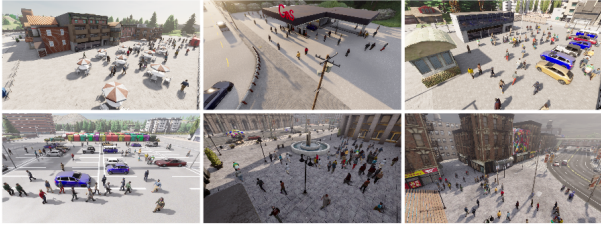
Figure 1: Different scenarios: a. Terrace (top left), b. Gas station (top centre), c. Small parking (bottom left), d. Square (bottom centre), e. Stairs (bottom right)

camera. Each camera position was selected manually to simulate real CCTV camera positions, as in Figure 2 and randomized in each simulation to get different points of view. This resulted in a large number of different viewpoints for each simulation, reducing the number of executions and producing variety in the dataset.