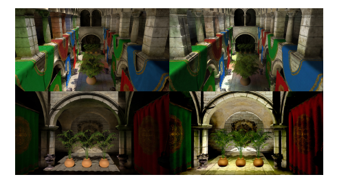
Figure 1: The Crytek Sponza Scene with two sets of images, the left of each pair using NVIDIA's DXR and the right using a Voxel-Based ray marching technique.