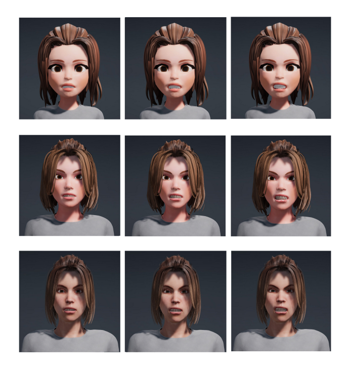
Figure 4: Visual realism conditions of the female character (from stylized (left) to realistic (right)) and intensity of the sadness expression (from low (top) to exaggerated (bottom)).

Figure 3: Screenshots of the three male and female virtual characters