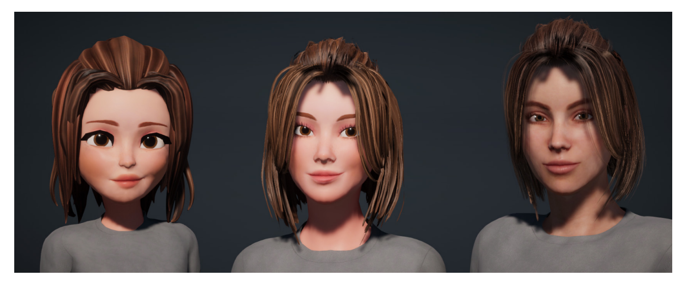
Figure 1: Stylized, semi-realistic and realistic female characters used in the online experiment.

<sup>1</sup>Arts et Métiers Institute of Technology, France