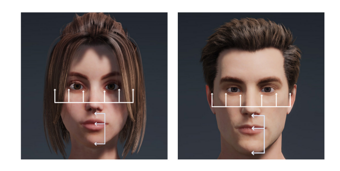
Figure 2: Corrected ratios of Chen et al. [CZ14] on realistic conditions.

We designed an online questionnaire for distribution in computer science schools and on mailing lists in extended realities and human-computer interaction communities. 165 participants took part in this study. As it was not possible to guarantee similar exposure conditions due to the online nature of the experiment, a series of exclusion rules were considered. We excluded participants who answered in less than 10 seconds per block (video and questions). Participants who exceeded 300 seconds per block were also excluded. These rules made it possible to exclude participants who responded without watching the videos and those who may have been interrupted. We also excluded participants who consistently chose extreme values on Likert items, indicating they were not pay-