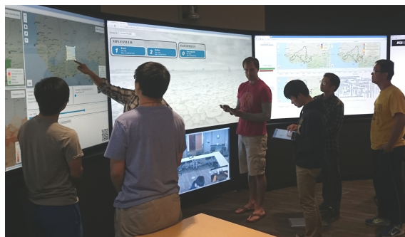
Figure 2: Users collaborating in the Decision Theater at ASU.

To demonstrate our framework and the provided multi-user interactions, we visualize water scarcity in the Niger River Basin in Western Africa. Users can select and combine several climate, water supply, and population growth models. The climate models are derived from different combinations of global and regional climate models developed through the Coordinated Regional Climate Downscaling Experiment (CORDEX) database. Sponsored by the World