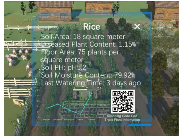
Figure 2: Traceability of Plant Growth.

products is estimated. Combined with the current market demand information and the market historical demand information, to estimate the future income of the crop products can maximize the benefits. Farmers are provided with application services such as real-time calculation of profit maximization based on the conditions of agricultural products. Through Blockchain, from seeding and growth to processing and production, the supply chain management has greatly increased the safety of edible agricultural products. During the growth and development process recorded by the QR code, it can also protect the rights and interests of consumers, and creating a safe food safety environment [PS06].