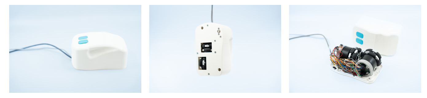
Figure 1: The CASTOR mouse with its two omni-wheels protruding from the bottom and the BLDC motors inside the shell.

cantly differently from regular mice. One early example exists of an unanchored mouse [AS94], that provides friction through an electromagnet inside the mouse and a solenoid to prod the user's finger. Since then, some advancements have been made, first by Kudo et al. [KSK07] who created an unanchored 2dof ball mouse with force feedback, and later Kianzad and MacLean [KM18] who created a similarly functioning, miniaturised mechanism in a pen-like device.