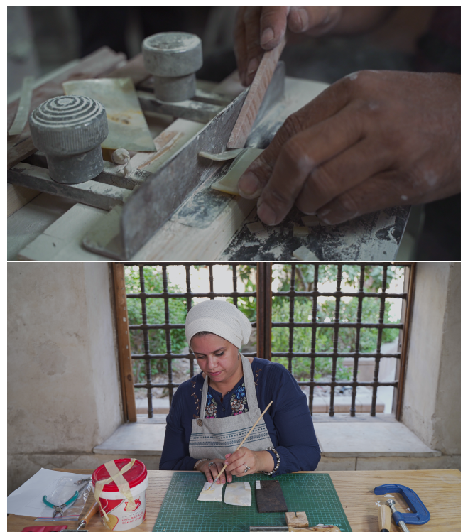
Figure 2: Visual material documenting processes of inlay woodwork craft.

Our approach, which was deployed during the COVID pandemic in 2020/2021, involved the co-design and co-production of photographic and film material. During this period, researchers were unable to travel to Cairo to acquire data. Hence, in collaboration with local crafters, the best approach for filming and digital photography was decided. Crafters who had been involved in developing the knowledge structure collaborated with a local filmmaker to produce extensive material for each of the processes and stages of inlay craft based on a clear and comprehensive co-designed structure. Figure 2 presents two photographs acquired during digital documentation, for the stages of Cutting and shaping the inlay material illustrated in the top part, and for Joining and fixing the inlaid product illustrated in the bottom part. Two films were produced documenting both the traditional and modern techniques of the inlay process execution.