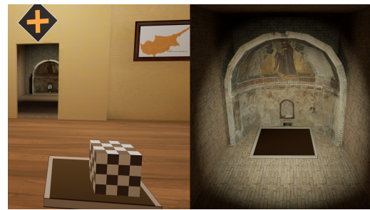
Figure 2: Inserting a resized cube into a trigger box unlocks a hidden room showcasing the famous 6th-century wall mosaic in Aggeloktisti.

The difficulty of the game is increased as the player progresses through the rooms. This is implemented by introducing new and combinations of challenges, riddles are harder to solve, challenges require multiple tasks to be completed, and less clues are provided to the players. The key game mechanics were developed by the second author of this paper as part of the requirements for his undergraduate degree final year project, under the supervision and guidance from the first author.