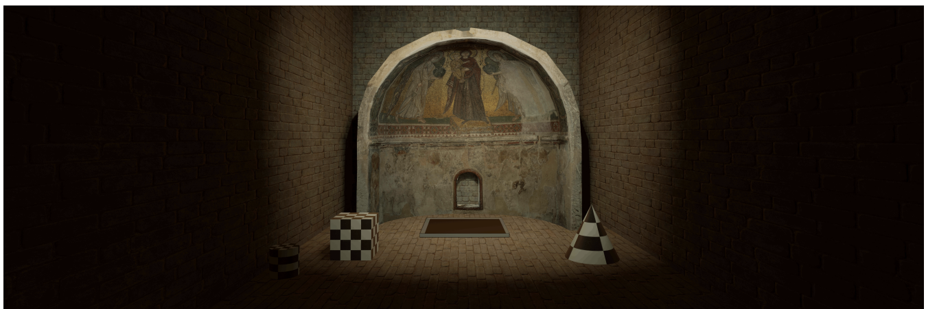
Figure 1: A view of a hidden room featuring the 6th century mosaic of Panayia Aggeloktisti church

1 School of Sciences, University of Central Lancashire, Cyprus