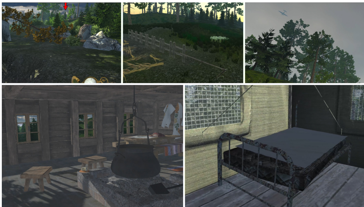
Figure 6: Gameplays: a) hiding from enemies (up left), b) collecting herbs (up middle), c) hiding from bombs (up right), d) packing food (down left), e) making stretcher (down right)

our prediction that the mixture of the Gameplays with the Narrative has a positive effect on Immersion and Edutainment. Mean values for the items measuring the Immersion are in the range of 4.00 and 4.59, and for the Edutainment items in the range of 4.27 and 4.59. Mean values for items reflecting ease of use are in the range of 2.32 and 4.32. The results for this part of the evaluation are presented graphically in Fig. 7 showing frequencies of answers per each item linked to the specific construct of interest.