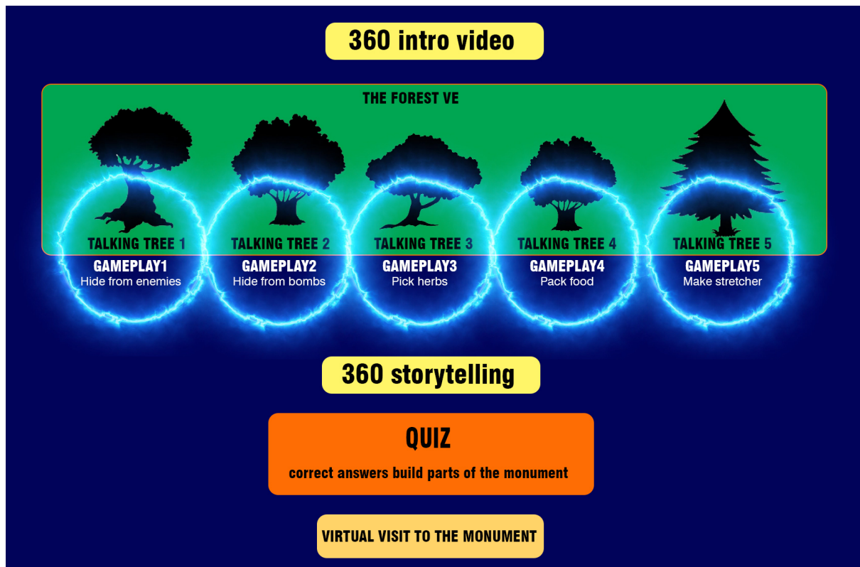
Figure 2: Application structure scheme, Battle on Kozara VR

how to overcome the "narrative paradox", the conflict between the interactor's freedom of choice (or agency) and the author's control over the story world [Sme19]. We faced this problem during the development of our digital heritage applications, as we usually offered the user historical information in form of several short stories. Considering that those stories were implemented to be watched on demand, it was possible that some of them will never be selected.