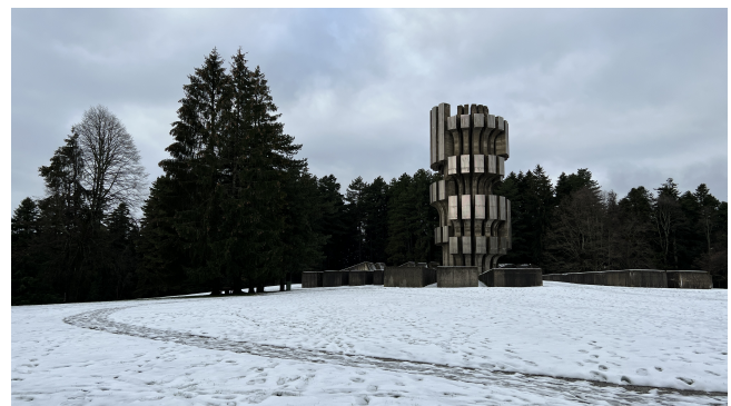
Figure 1: Monument to the Battle on Kozara, Mrakovica, Bosnia and Herzegovina

It would be difficult to mark all the places and preserve the memory of all those who were a part of it. That is why in 1972, a memorial complex on Mrakovica was built, consisting of the Revolution Monument (Fig. 1), the Memorial Wall, and the Memorial Museum, in which now, with the help of the Virtual Reality application, the Kozara forest will tell the story of the Battle and its heroes. The Virtual Reality application allows visitors of the Memorial Museum in Mrakovica to take part in this famous battle and to solve the tasks that are set before them to build the imposing Monument to the Revolution.