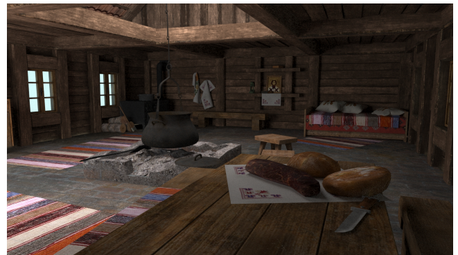
Figure 4: Village house 3D model

In the first gameplay, the user can experience the feelings of horror and fear that Kozara people went through, being hunted by enemies in the forest and hiding in caves and shelters. The clock is ticking while the user navigates through the terrain to get to the destination marked by a red arrow (Figure 6.a). Sometimes there is a need to crawl under the branches or jump over obstacles.