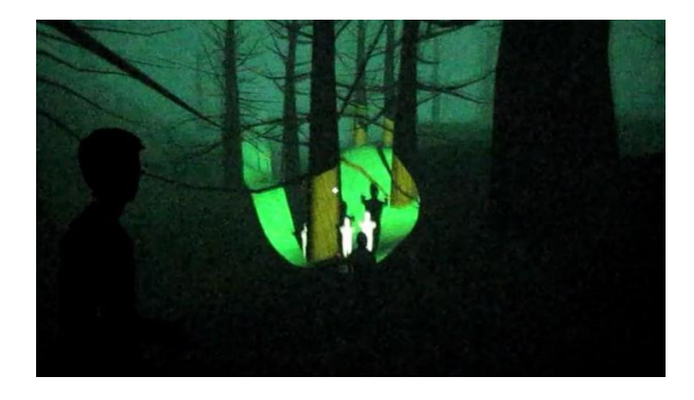
Figure 7: User interacting with Zombie Apocalypse in front of a large screen.

The Zombie Apocalypse project explores a single point directional light source and x-box control for an immersive experience of surviving a zombie attack in a winter forest (see Figure 7 and Video Figure 1). It also explores real-time large-scale landscape rendering, fog, and tree model generation.