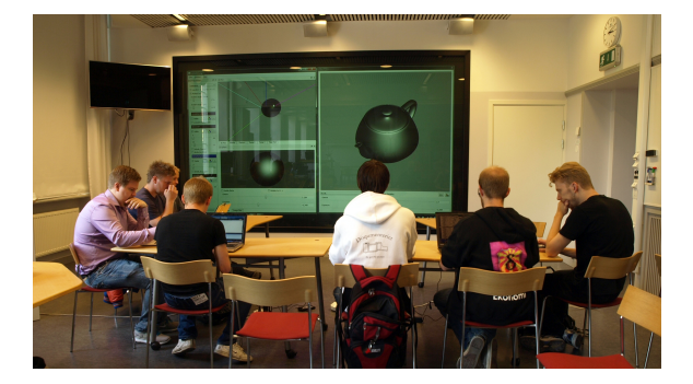
Figure 9: The Visualization Studio at KTH as a studiobased learning environment.