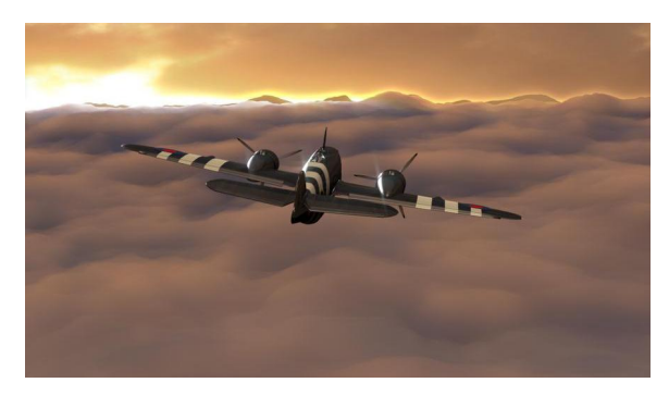
Figure 8: Screen shot of Android Air Battle.

position, direction, and speed of individual airplanes, and the combined actions of the players.