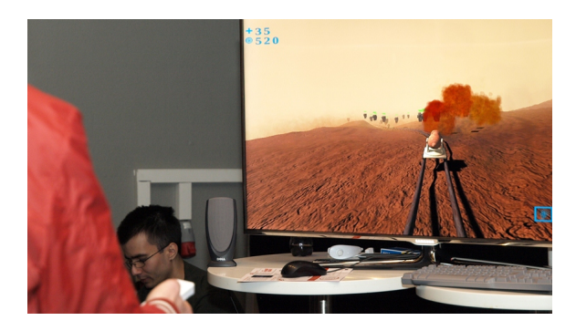
Figure 3: User interacting with Dust Storm.

The Dust Storm project combined real-time particle systems simulating wind, gravity, and density with gesturebased interaction through the wii mote (see Figure 3 and Video Figure 1). The group created a railed-shooter game where the object of the game is to destroy opponent turrets on a desert planet as the railed cannon is passing by the standing opponents. The player loses by allowing too many turrets to survive.