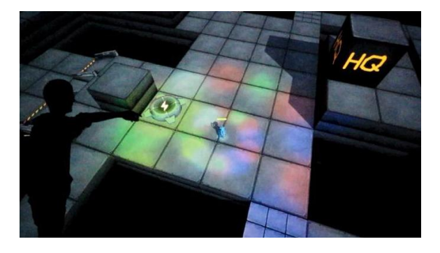
Figure 5: Student explaining deferred rendering in Warbots.

The Warbots project combined deferred rendering for real-time multipoint light source generation and multiplayer interaction (see Figure 5 and Video Figure 1). Warbots is a group tactics game where the object of play is the conquest of the opposing team'sheadquarters. Each team is composed of three robots with specialized roles that must collaborate to win the game.