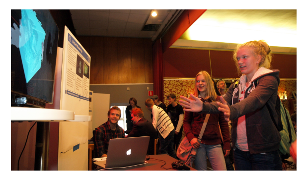
Figure 10: Audience members at Researcher's Night interacting with Virtual Sculpting.

keep class interesting and up to the students to participate. Everyone made a significant effort to participate physically or remotely. Interestingly, traditional email and class website were inconsequent. Not unexpectedly, using cell phone calls and sms became a major coordination tool for last-minute event planning. The teacher shared cell phone numbers with the students on the first weeks of class. A take away point in this section is the extraordinary need for online coordination and collaboration tools to offload the burden on class time. In a future instance of this course, the teacher will engage the students online earlier and more actively and reserve the class periods for relevant learning material.